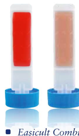
■ Easicult Combi